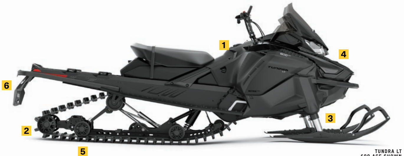
TUNDRA LT 600 ACE SHOWN

Industry-exclusive telescopic front suspension enables a large, flat belly pan for exceptional deep-snow flotation.