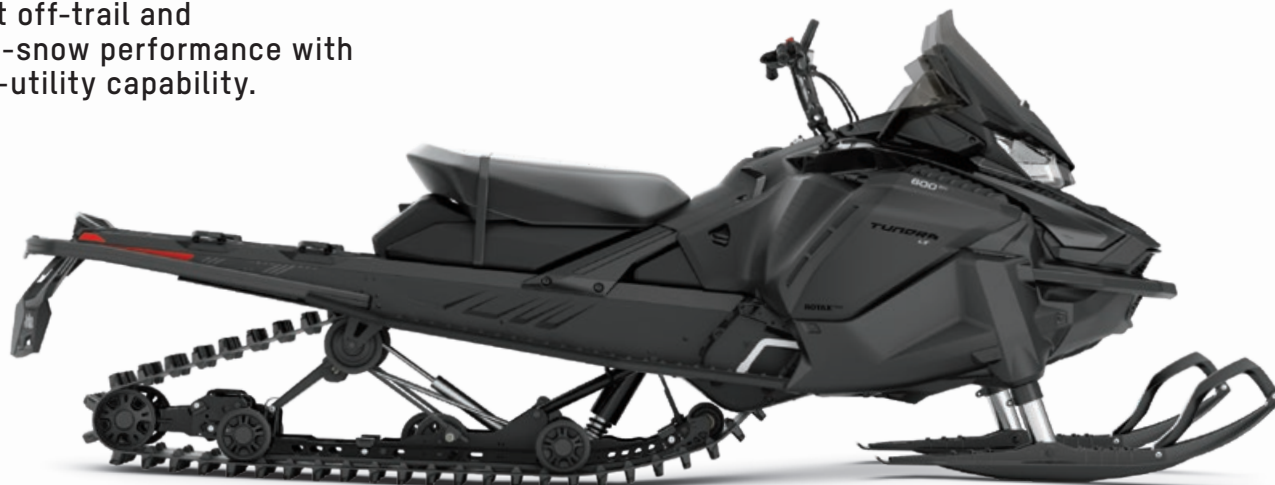
TUNDRA LT 600 ACE SHOWN

Great off-trail and deep-snow performance with light-utility capability.